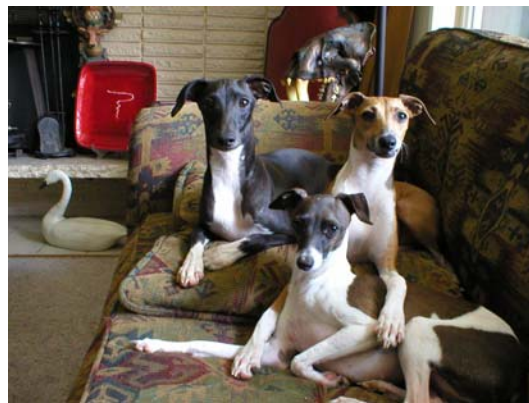
Luca, Pippin, Zoë and Gracie